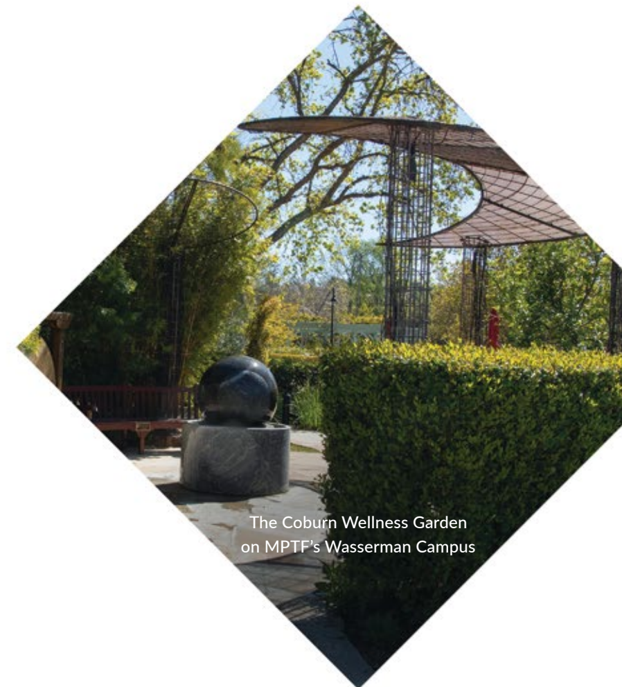
The Coburn Wellness Garden on MPTF's Wasserman Campus