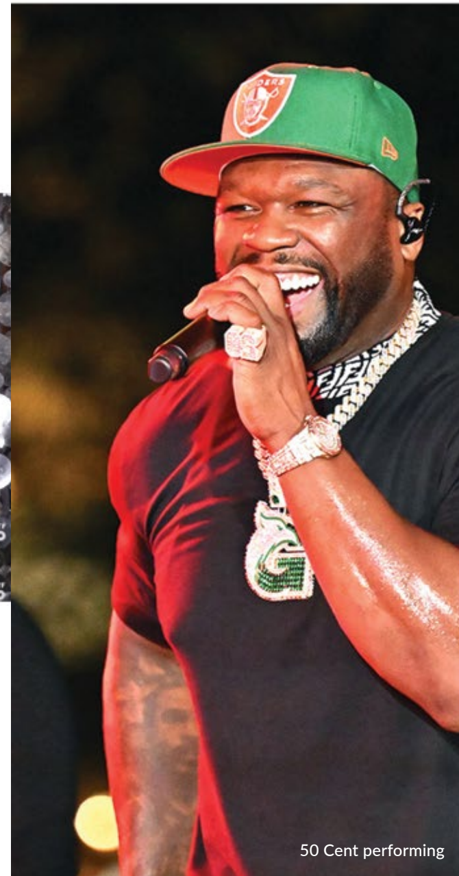
50 Cent performing

Calamigos Ranch in Malibu saw the return of our MPTF-IATSE fundraiser, a fun day for the whole family complete with a BBQ lunch buffet, picnic games, silent auction, and raffle.