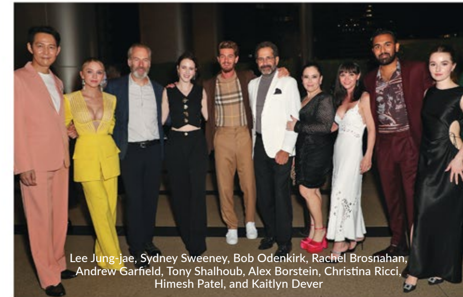
Lee Jung-jae, Sydney Sweeney, Bob Odenkirk, Rachel Brosnahan, Andrew Garfield, Tony Shalhoub, Alex Borstein, Christina Ricci, Himesh Patel, and Kaitlyn Dever