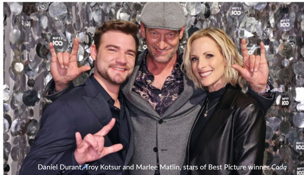
Daniel Durant, Troy Kotsur and Marlee Matlin, stars of Best Picture winner Coda

Our annual star-studded benefit before the Academy Awards® reached a milestone of 20 years, celebrating two decades of nominees, presenters, and industry influencers while raising funds for members of the entertainment community. The event raised close to $4.5 million.