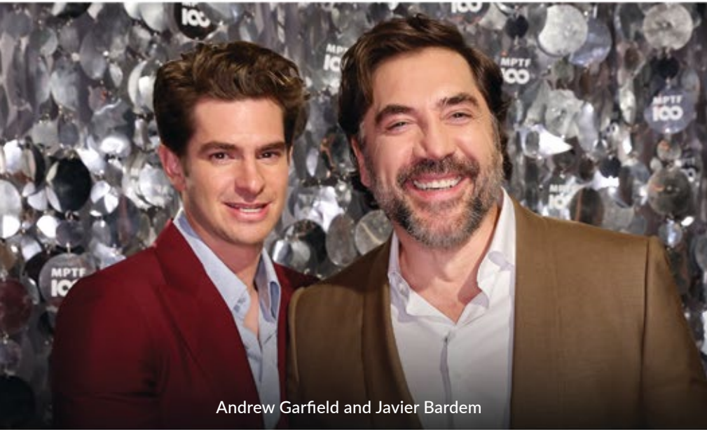
Andrew Garfield and Javier Bardem

Thanks to the ongoing support and generosity of our corporate sponsors, donors, and advocates, our annual events were vital in continuing MPTF's mission to support members of the entertainment industry across generations with health and social services, temporary financial assistance, case management, and residential living.